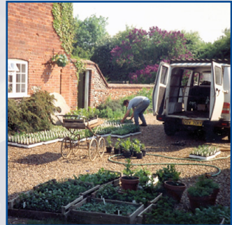
Loading the old Bedford van at Mill Farm in the 1980s