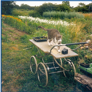
Our first plant trolley at Mill Farm in the 1980s