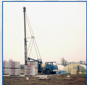
The shop being built and bore hole drilled at Blackberry Farm in 1992