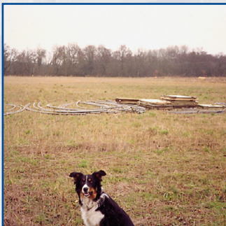
Our new bare field site at Blackberry Farm in 1992